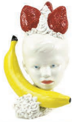
"Boy 2" sculpture by Pansy Ass Ceramics , $1,200 at Superfine, booth No. 43