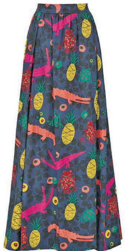
LHD "Delano" skirt, $750 at the Webster, 1220 Collins Ave.