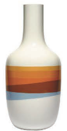
Scholten & Baijings for Sèvres "Vase 2.5," $7,000 at Les Ateliers Courbet at the Surf Club, 9101 Collins Ave., Surfside, Fla.