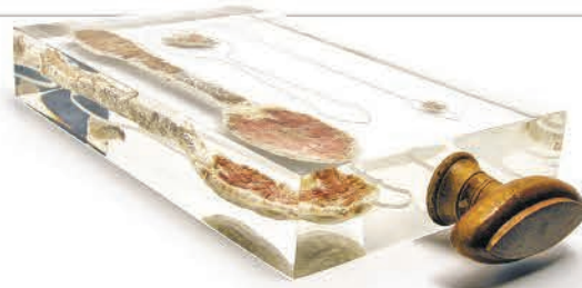
"Drawer's Delight 4" by Ted Noten , $18,500 at Design Miami via Ornamentum Gallery