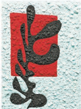
"Metachrome (cut-outs, after Henri Matisse)" archival inkjet prints (set of six) by Vik Muniz , from $85,000 at Art Basel Miami Beach via Sikkema Jenkins & Co.