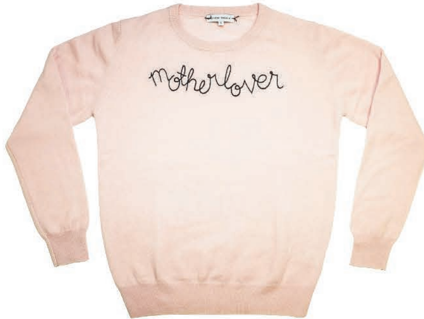
Lingua Franca "Motherlover" sweater, $400 at the Miami Goop Gift pop-up, 151 NE 41st St.