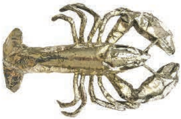
"Wrapped Lobster" sculpture by Gemma Gené , $2,800 at Superfine, booth No. 9