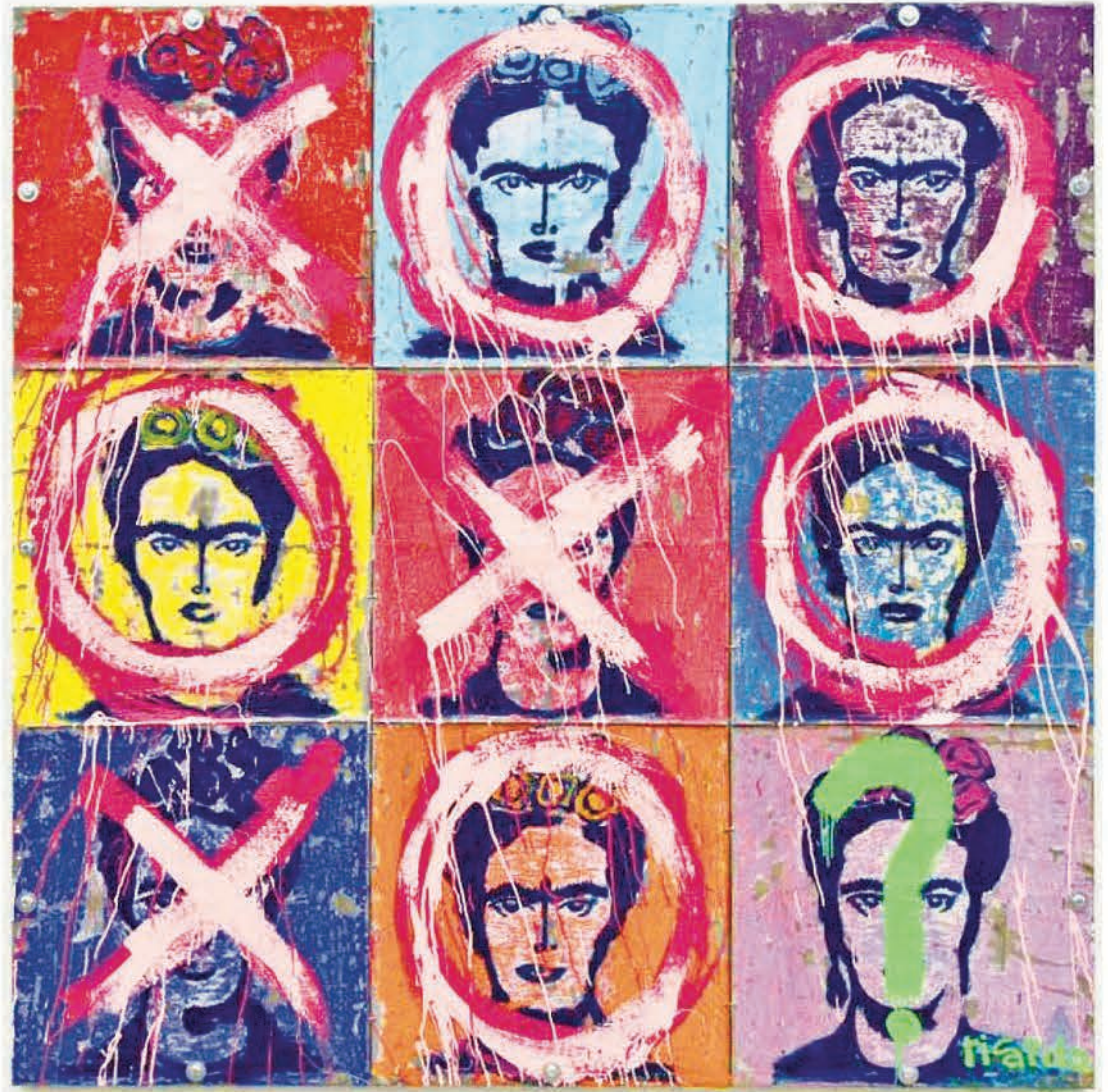
"El Juego de la Frida" painting (on concrete recovered from one of the recent earthquakes in Mexico) by Ricardo Cardenas , $10,000 at Red Dot Miami via Contemporary Art Projects