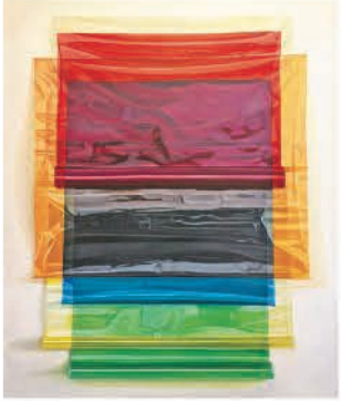
"Celofán" mixed-media work by Nicolás Radic , price upon request at Pinta Miami via Galería XS