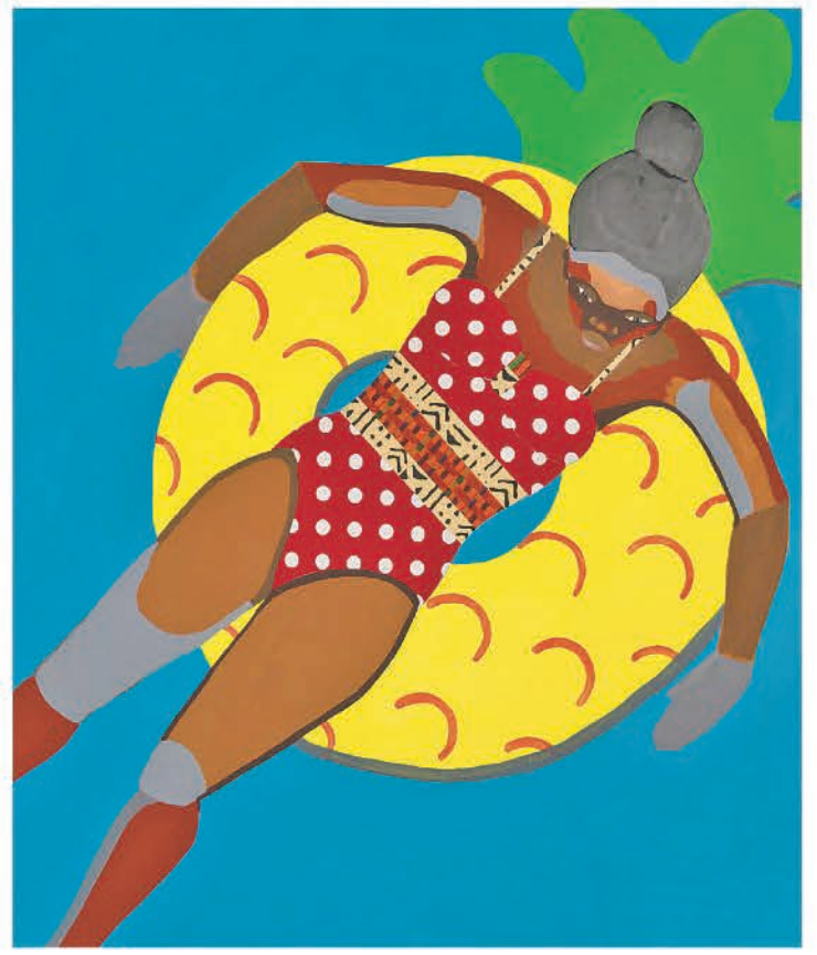
"Floater No. 36" painting by Derrick Adams , price upon request at Art Basel Miami Beach via Rhona Hoffman Gallery