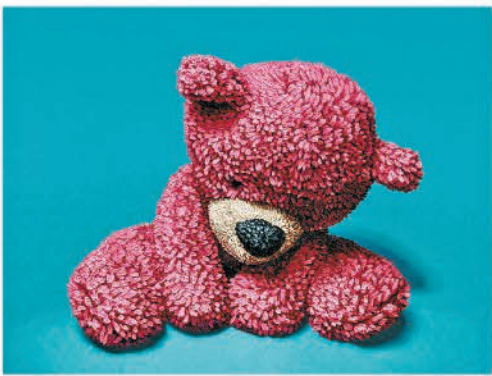
"Pink Bear Sitting" painting by Brent Estabrook , $60,000 at Context Art Miami via Mugello Gallery