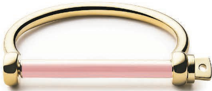
Miansal "Screw Cuff" bracelet, $225 at the Museum of Ice Cream in the Faena Forum, 3300 Collins Ave.